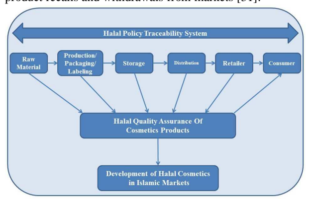
Figure 1- Research model (First conceptual model)

Although the advantages of traceability such as health, quality, safety and control make consumers to be confident about products [28], [35], but technically, product safety and quality is enumerated as the first intentions of product traceability [30]. The business manner tries to raise the information connectivity through the supply chain and the quality of product traceability could be affected by the degree of network transparency [35]. Storing the essential information of related inputs and outputs of the food products in the supply chain is another advantage for all the stakeholders [36] and finally according to the report of expert group, traceability is not only an important help for authorities to get required information about products and different actors of supply chains but also organized traceability of whole supply chain can be advantageous to economic players, authorities and end consumers such as identification of economic operators and physical products for effective product recalls and withdrawals from markets [31].