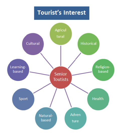
Figure 3. The connectivity of tourism supply chain according to tourist's interest

Therefore, the tourism supply chain connectivity for seniors according to their interests (9 themes, 7Re and Club 55) in Lanna region can be concluded in table4 (See Appendix A)