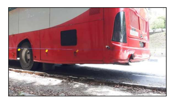
Figure 5: Damages mark on the left rear side of a 12-metre bus.

bus body caused by rear swing out of a normal 12metre bus. Therefore, allowing a single rigid, long buses of 15-metre to operate in Malaysia may require the drivers to undergo a special training.