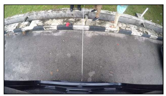
Figure 2: The view angle of the action camera.

The action camera was mounted on a standard mounting accessory pointing rearward at the rear and the mounting was attached to the bus body using a 3M double sided tapes. The view angle was 120 degrees and set to represent the excessive 3 m of long bus (overall length of 15 m) from the rear bumper (see Figure 2). Any infrastructure viewed in the video recording will be identified as the possible impact.