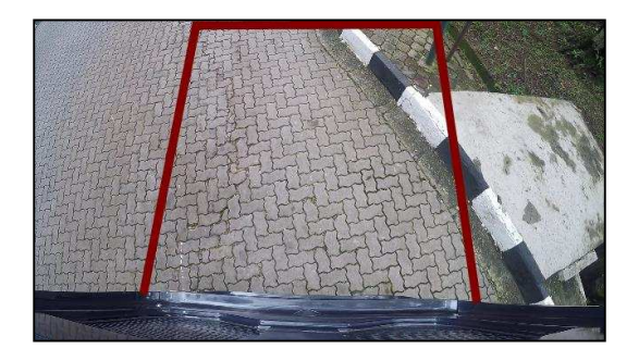
Figure 3: Sign post viewed in the video recording while the bus exiting a side bus stop.

From the observations made through the video recording, it was found the video recording was able to represent the excessive 3 m of long bus. It was evidenced that the potential infrastructures that could cause damages to the infrastructure and bus whenever the bus maneuver at intersections, roundabouts or bus stops were recorded. Road furniture such as sign post and road curb were viewed in the video recording (see Figure 3). Besides, encroachment of the bus rear into the adjacent lane was observed during maneuver and it may hit other vehicles (see Figure 4).