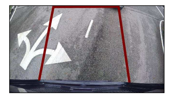
Figure 4: The bus excessive imaginary line at the rear encroached into the adjacent lane during left turn manouevre at intersection.

Based on study by Sleath et al. (2006), the difference of rear swing out performance of the actual and design bus is 28%. As the difference is quite small, the predicted impact from the observation may be otherwise (safe) for long bus. The results will be slightly different from the actual 15-m bus where the longer wheelbase and shorter rear overhang would show better rear swing out performance <sup>4</sup>. Whilst the analysis was qualitative, the method will not be able to confirm the predicted impact of long bus rear swing out performance. Nevertheless, near miss impact shall suggest better on-road long bus rear swing out performance.